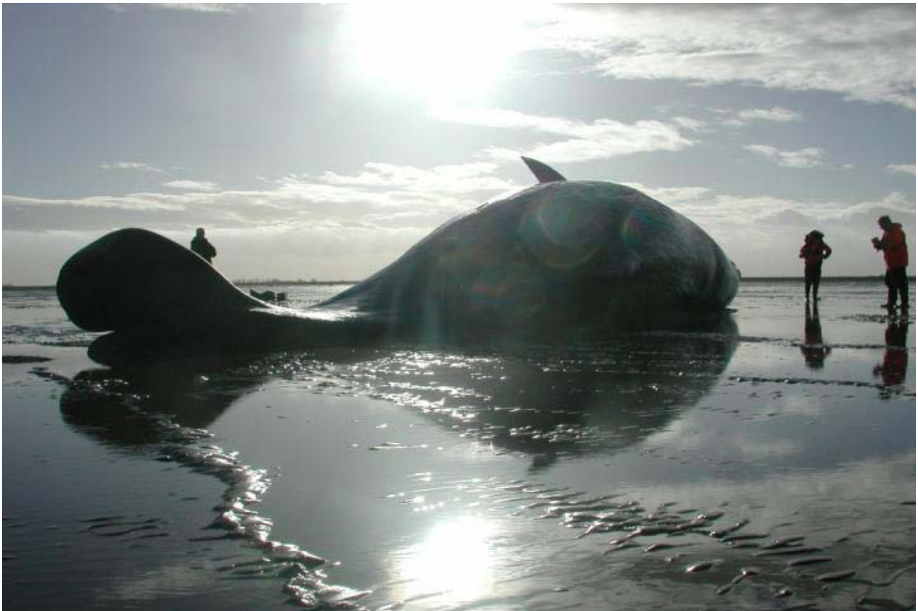
Figure 1: Stranded sperm whale near Kings Lynn, Norfolk

The UK Government and Devolved Administrations are continuing to support the UK Cetacean Strandings Investigation Programme and it has been extended to collect data on stranded marine turtles and basking sharks.